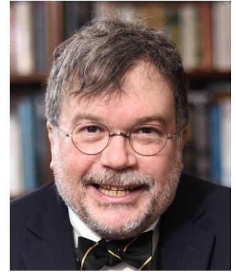
Peter Hotez, MD, MPH